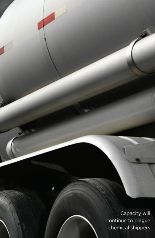
Capacity will continue to plague chemical shippers

freight product offerings to meet this demand, as well as its global network to support expanded supply chain requirements, he said.